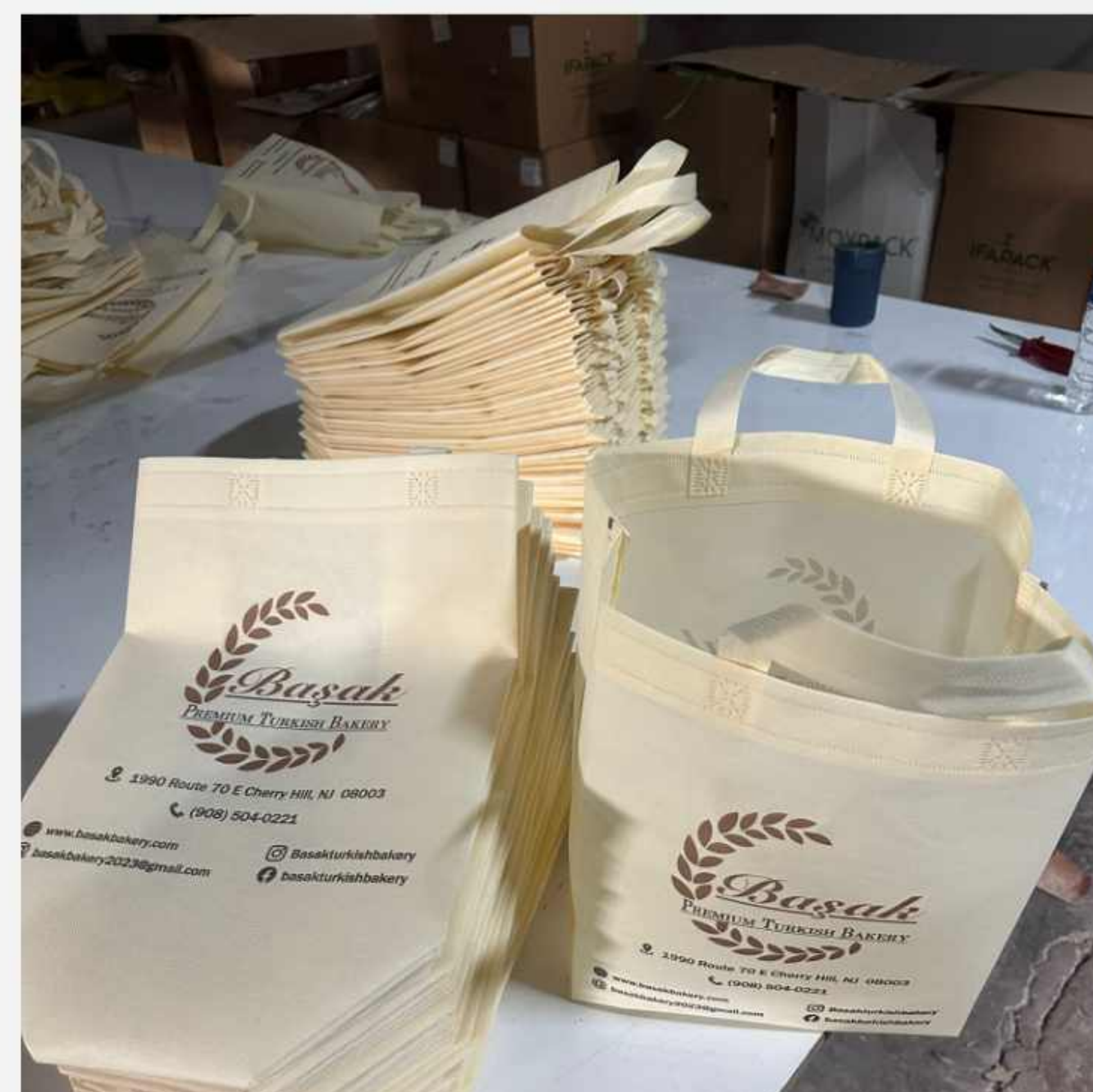
Box Shaped Non-Woven Bag