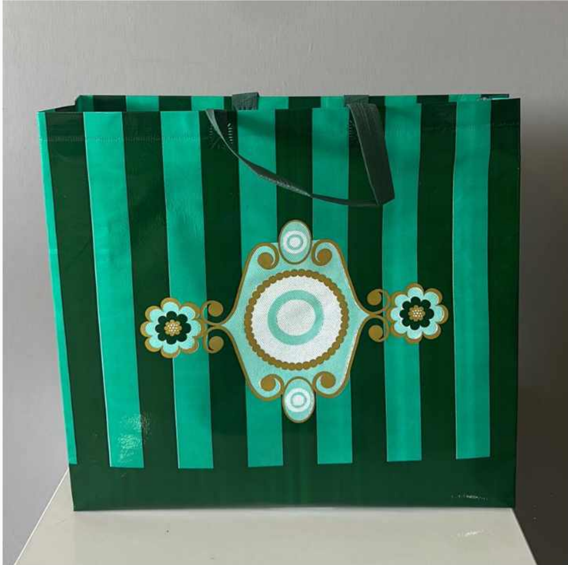
Laminated Non-Woven Bag