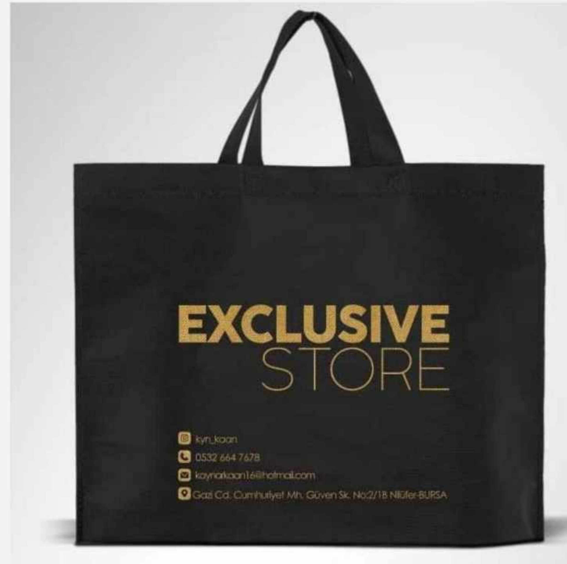
Non-Woven Store Bag