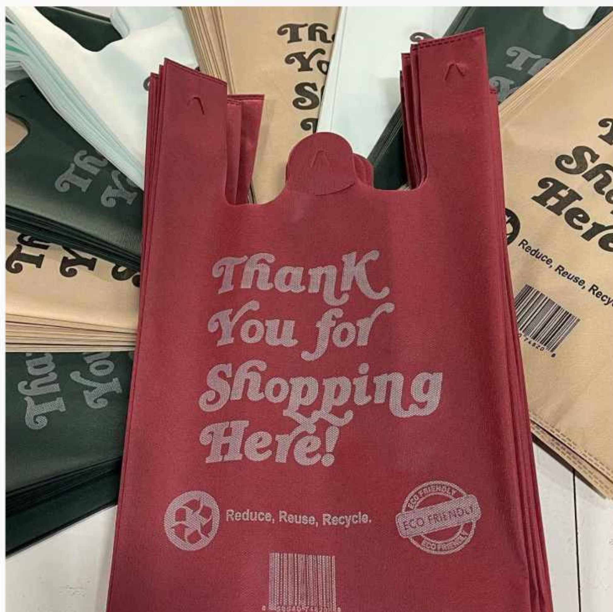
T-Shirt Non-Woven Bag